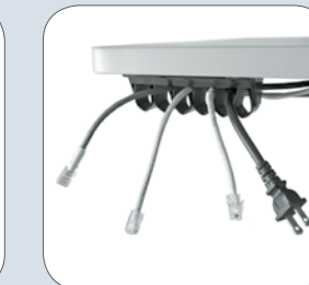
klipZ wire management