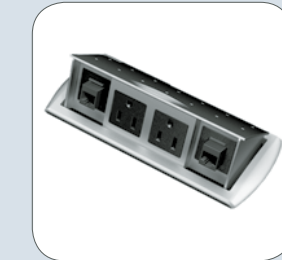
electrical & voice/data receptacles

SIS offers easy-to-install upgrades for your office solutions. Upgrades provide added flexibility and greater return on investment for your workstation.