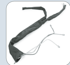
vertical zipZ wire management