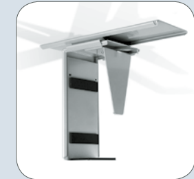
surface mounted CPU holders

geneSIS v2 - fully adjustable FPD arm system available in gas, crank or electric to support single or multiple flat panel monitors