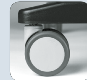
casters 1" to 5" heavy duty

geneSIS v2 - fully adjustable FPD arm system available in gas, crank or electric to support single or multiple flat panel monitors