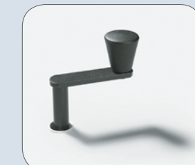
removable crank height adjustment

adjustable height ranges from 23" - 35.5"